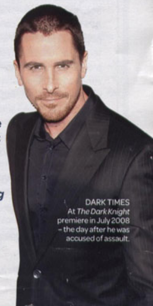
DARK TIMES At The Dark Knight premiere in July 2008 – the day after he was accused of assault.

Terminator Salvation is showing from Fri 3 Sept at 8pm on SM Premiere / HD; The Terminator and Terminator 2: Judgment Day double bill is showing on Fri 3 at 3.40pm and 10pm on Sci-Fi & Horror / HD; The Dark Knight is showing from Mon 6 Sept at 10pm on Showcase / HD as part of the 100 Million Dollar Week