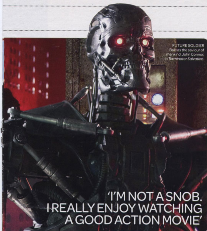
FUTURE SOLDIER Bale as the saviour of mankind, John Connor, in Terminator Salvation .

'I'M NOT A SNOB. I REALLY ENJOY WATCHING A GOOD ACTION MOVIE'