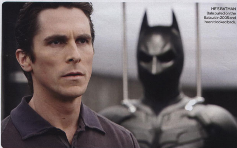
HE'S BATMAN Bale pulled on the Batsuit in 2005 and hasn't looked back.

But for all these well-publicised travails, top-class directors remain hugely keen to work with Bale. One thing he's not short of is offers from some of the most