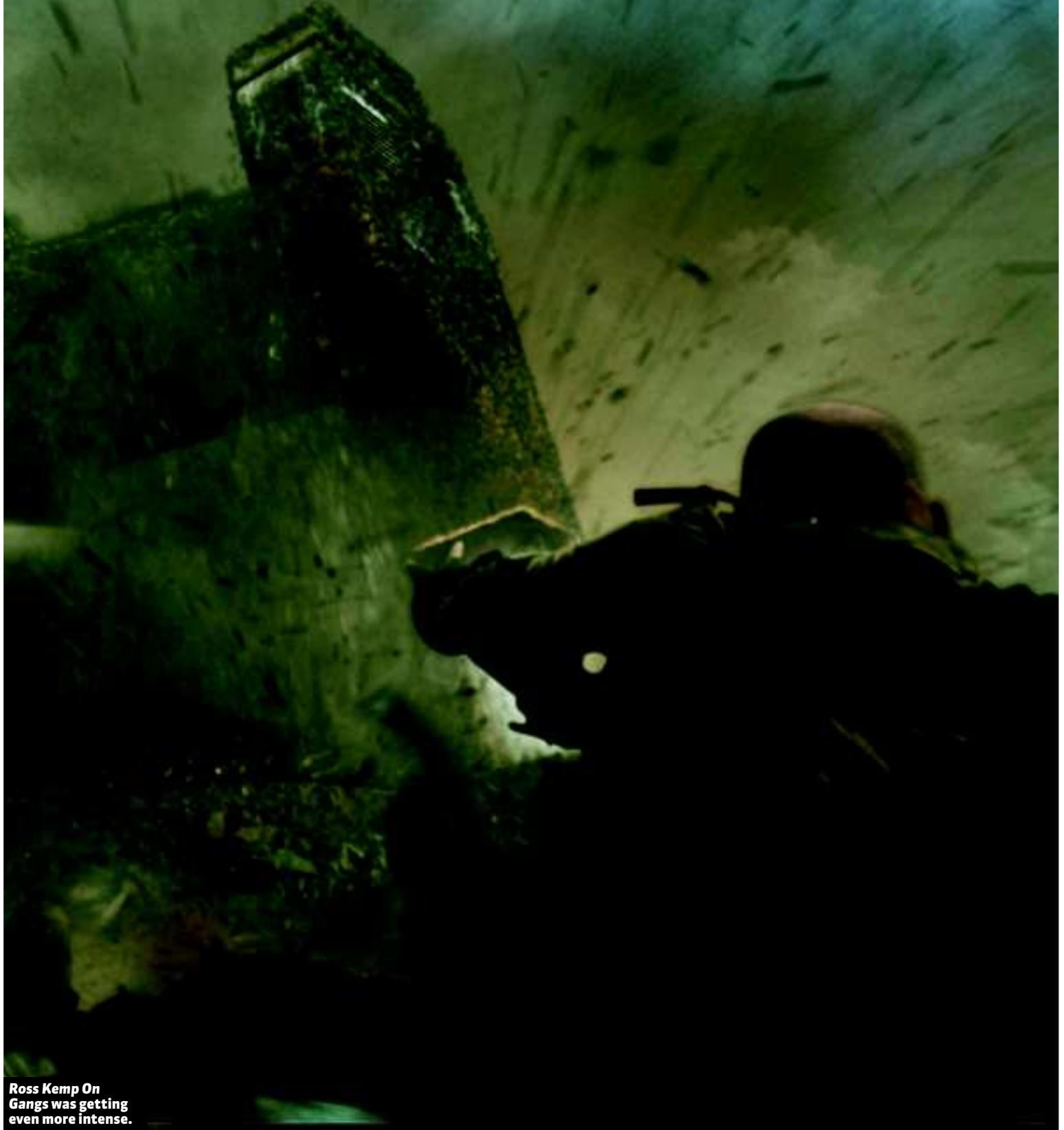
Ross Kemp On Gangs was getting even more intense.

★★★★★ OUTSTANDING ★★★★★ VERY GOOD ★★★ GOOD ★★ DISAPPOINTING ★ RUBBISH