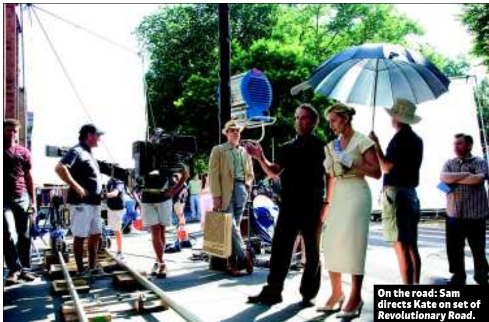
On the road: Sam directs Kate on set of Revolutionary Road.

Mendes is an altogether sunnier fellow, a charming, affable filmmaker who just happens to be drawn to dark, nasty stories that reflect the repression and malice riddling America's institutional fairytale. "Yes, the setting is specifically American," agrees Mendes, "but the idea at the centre of Revolutionary Road is what happens if you wake up one day in your '30s and you realise you're not living the life you wanted – you had kids when you didn't want them, you're not sure you married the right person. How do you fulfil the dreams you had when you were young? That's a universal theme that could be set at any time, in any country."