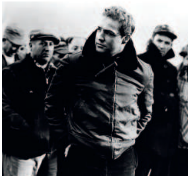
Quay to success: a turn as docker Terry Malloy in On The Waterfront won Brando his first Oscar.

Later, his troubled daughter Cheyenne told Christian that her boyfriend was beating her (falsely, it turned out). Christian shot and killed the boyfriend in Brando's living room, resulting in a scandal-baiting trial at which the tabloids mocked Brando's whale-like expansion and mumbling testimony. Christian went to jail for five years; Cheyenne committed suicide in 1995.