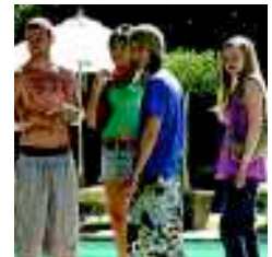
Home girl: Seyfried with Justin Timberlake and co in Alpha Dog .

Red Riding Hood opens on 15 April and will be reviewed in a future issue. For more features and video go to totalfilm.com