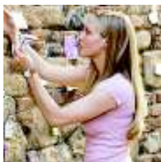
Note-worthy:(below) Seyfried in Letters To Juliet ; singing with Dominic Cooper in Mamma Mia!

And as far as she's concerned, werewolves are way cooler than their pasty supernatural counterparts: "I'm sick of vampires. So many of them are too feminine looking anyway. But a werewolf... it's got fur!" she says, clutching Finn's scruff. The actress also relished the prospect of tapping into Hardwicke's uncanny connection with the teen audience. "I feel like there's no judgment with them. I remember going to the movies with my friends and seeing The Fast And The Furious . I just went and