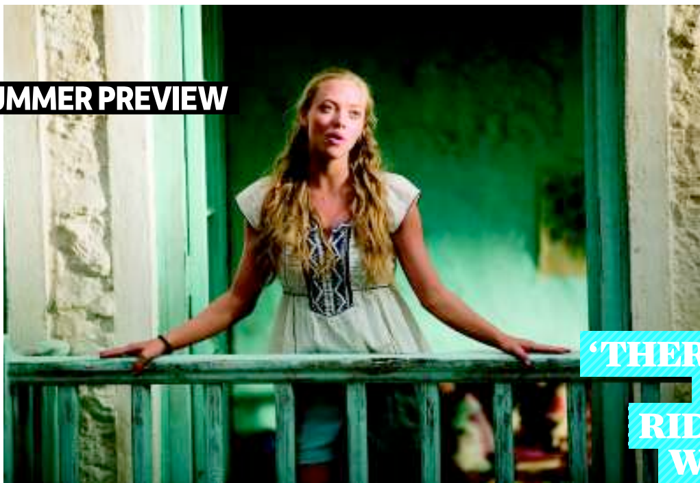
Sweetness and fright: (left) Seyfried in Mamma Mia! ; (right) with Gary Oldman in Red Riding Hood .

'THERE'S A LOT OF PASSION IN RED RIDING HOOD. WE'RE NOT SHY'