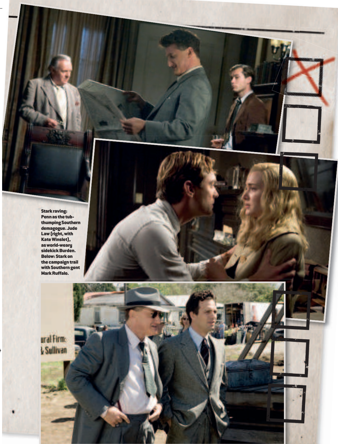
Stark raving: Penn as the tub-thumping Southern demagogue. Jude Law (right, with Kate Winslet), as world-weary sidekick Burden. Below: Stark on the campaign trail with Southern gent Mark Ruffalo.