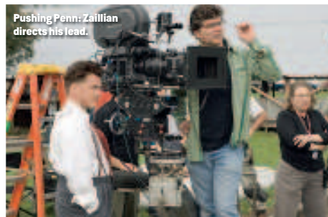
Pushing Penn: Zaillian directs his lead.

Zaillian packs plenty of thespian insulation around Penn's Oscar bid, with Jude Law as Stark's jaded right-hand man; James Gandolfini as a corridor-of-power crony; Patricia Clarkson as his acerbic aide-de-camp (and occasional bedmate);